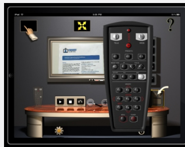
Main screen with virtual remote