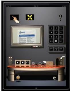
Controlling an EYE 12