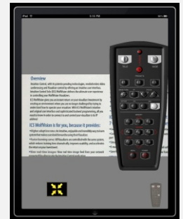
Full screen view with virtual remote