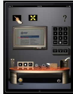
Visualizer Freeze On