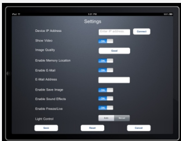
Adjust all settings