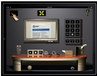
Controlling an EYE 12