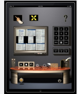
Showing all stored images