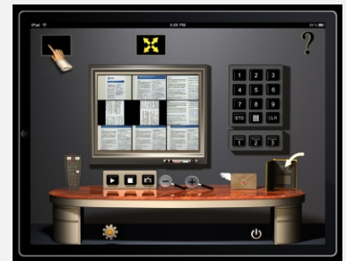
Showing all stored images