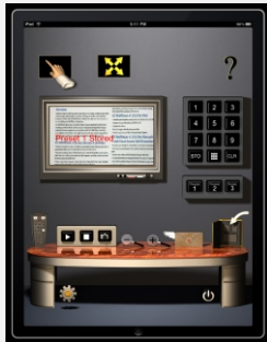
Stored Preset 1