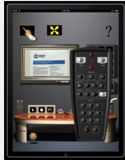
Main screen with virtual remote