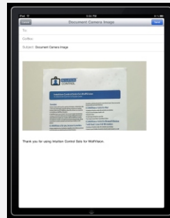
Sending an image in an email