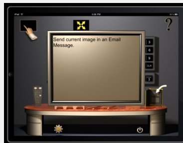
Dragged and dropped question mark on email icon